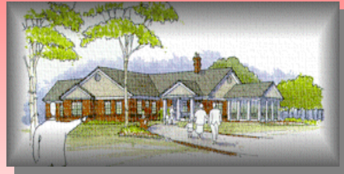
A Promising Future . . .

You and Your Lodge Can Make A Difference - Your Call to Action