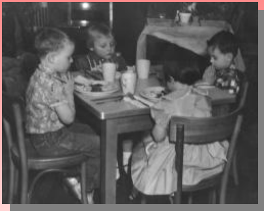
A Cherished Past . . .