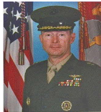
WB Gen. Tom Wilkerson, PM

In addition, with a new understanding of the impact of combat operations on individuals' mental and psychological health, "shell shock" is no more; in its place is Post-Traumatic Stress Disorder (PTSD), a treatable medical condition. So, there has been a flood of PTSD cases coming home from the war zone and from previous wars. There are more than 300,000 veterans suffering from PTSD, major depression and Traumatic Brain Injury (TBI). The VA is ill prepared to expedite their care and with 84,000 new veterans diagnosed with PTSD; the VA is well behind in approving their disability applications.